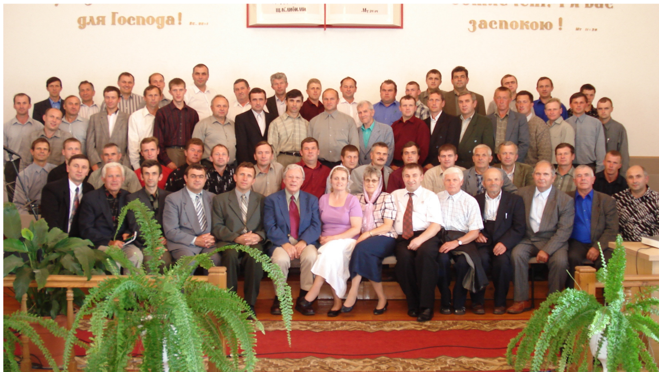
Team members with a group of pastors at one of the conferences

P.S. We return to Russia in November 2006. Will you pray about sending us as your missionaries? If you plan to go on the November trip with us, we must have a deposit of $300 as soon as possible. It will be a trip you won't forget. Check the website for the 5 missions planned for 2007: www.biblesforrussia.org