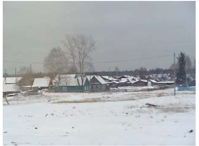
Village we viewed from the window of the train