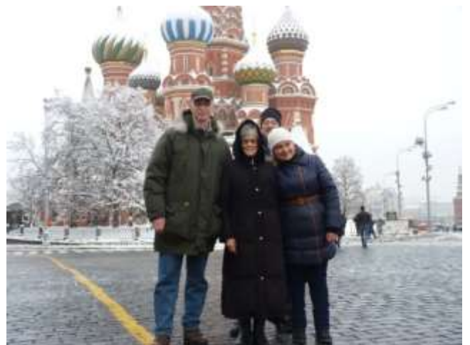
Our team at St. Basil's Cathedral in Moscow