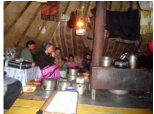
Inside the teepee