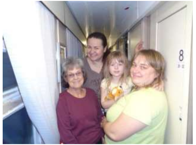
Lady and her daughter we met on the train