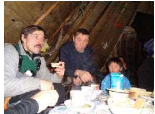
Having a meal with the family