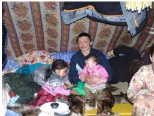
Father and children in the teepee