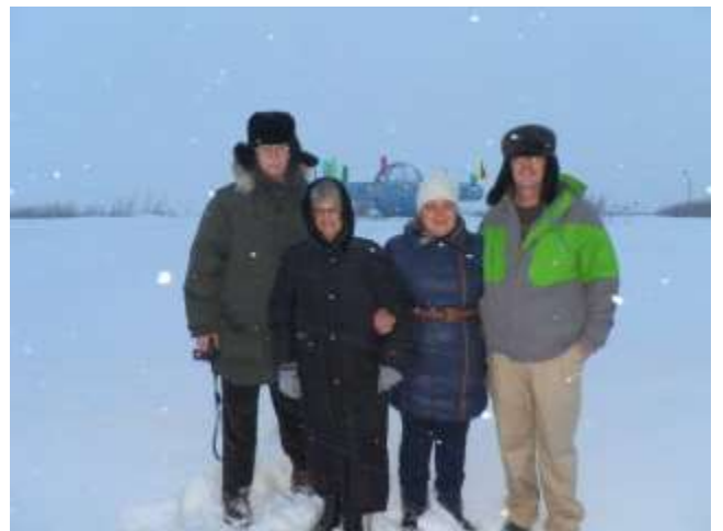
Our team at the 67th Parallel Monument in Vorkuta