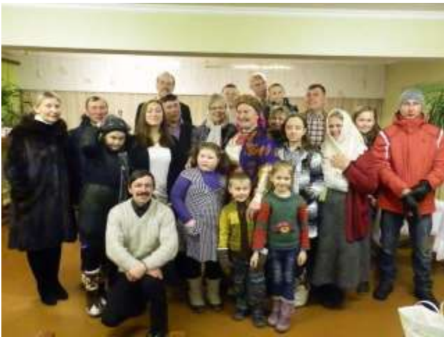
Some of the people of the church