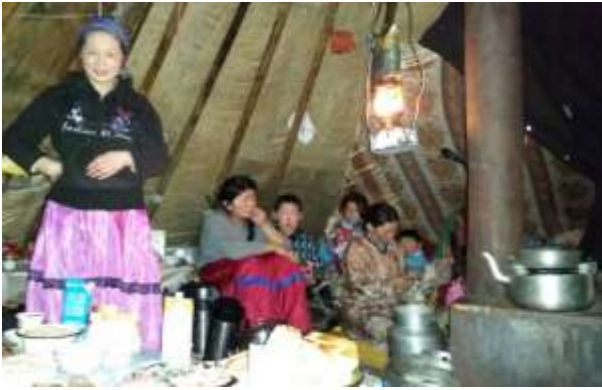
Inside the teepee of a reindeer herder family on the tundra