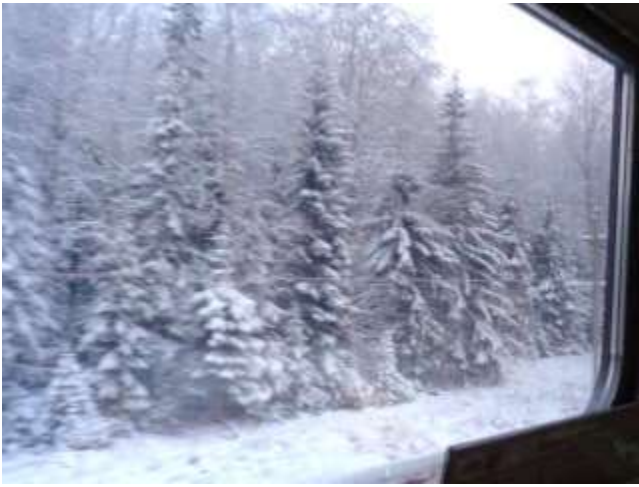
View from the train window