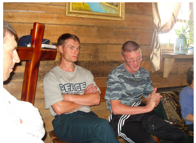
Two rehabilitated drug users, now brothers in Christ