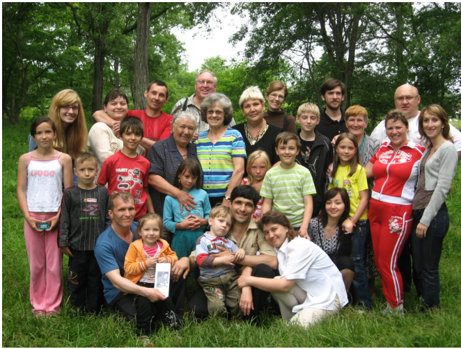
One of the new churches we recently planted in Vladivostok