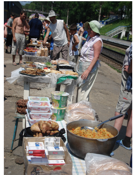
Siberian "7-11 Store" at one train stop