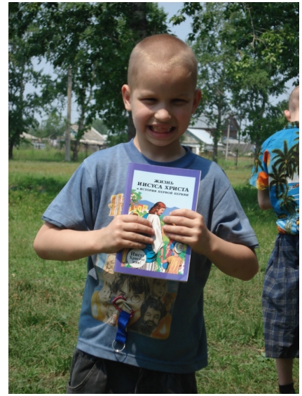
Orphan receiving his first Bible