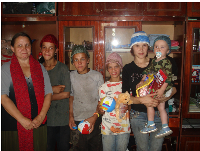
Visiting with a poor family with 11 children but no father