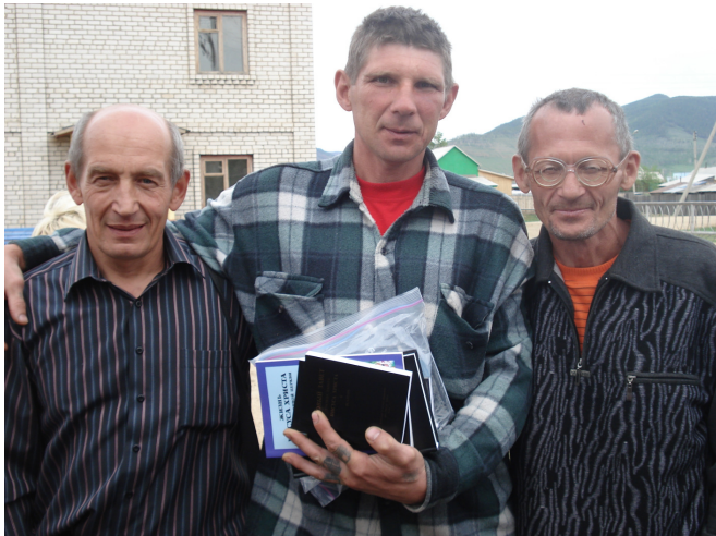
Distributing Bibles at a drug and alcohol rehab center in Duldurga