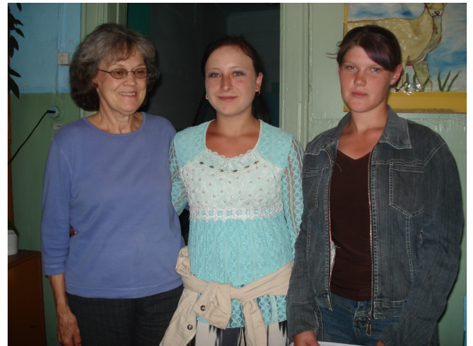
Two new converts at one of the 5 new churches we were able to plant