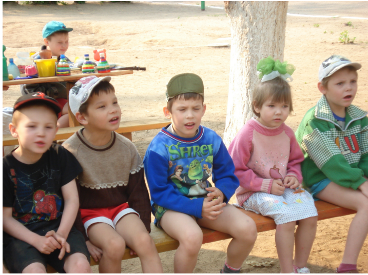
Orphans at children's hospital