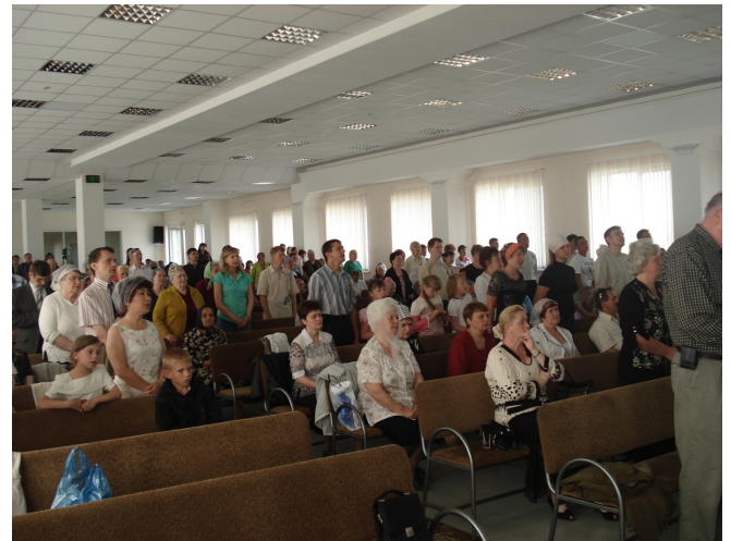
Church service in Angarsk