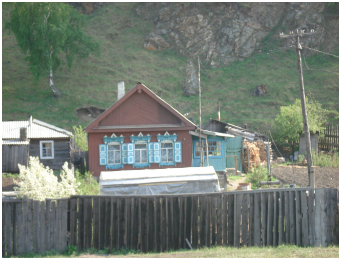
Typical village house