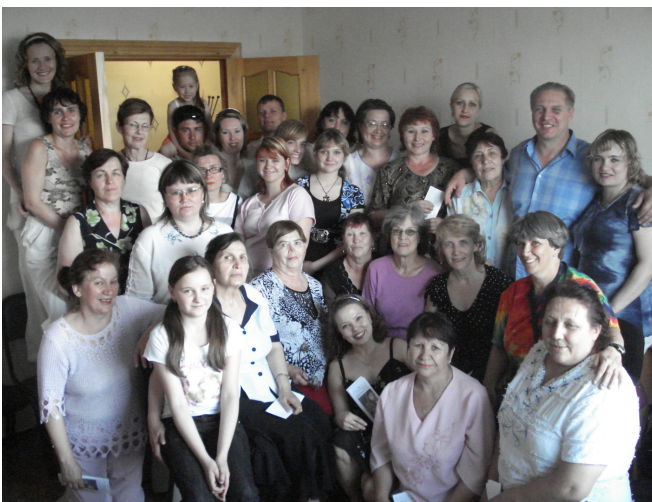
Pray for more men for this church in Chita