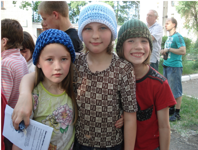
Knit hats made by friends in America