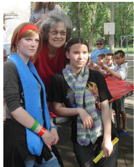
Orphans receive scarves made by friends in Alabama