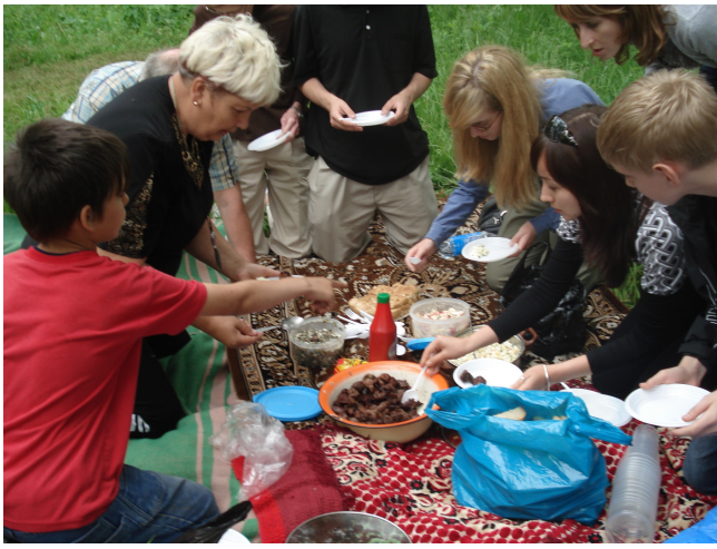
Picnic Russian style (on the ground) with church friends