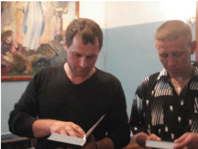
New brothers receiving their first Bible