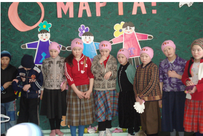
First generation of Nentsy to receive formal education