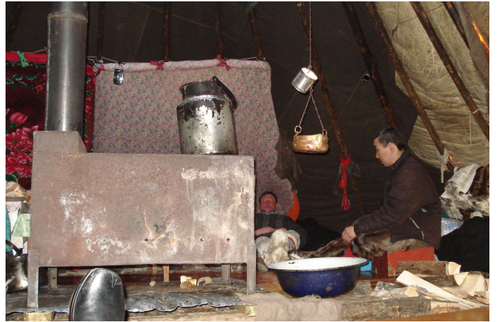
Cook stove and central heating system