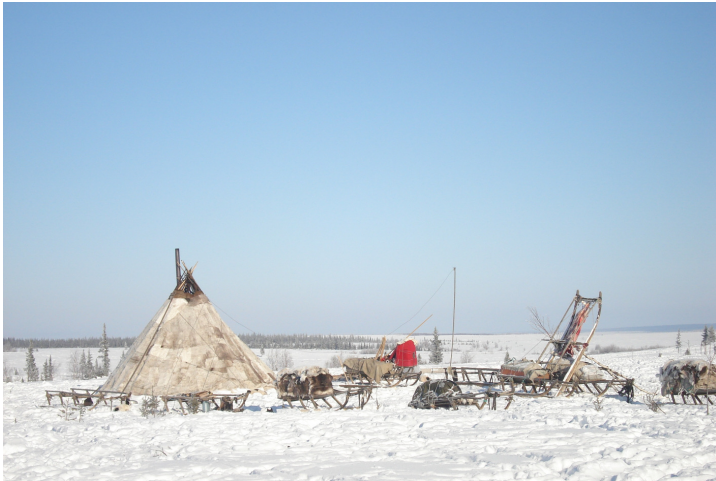
Nentsy tent home on the tundra