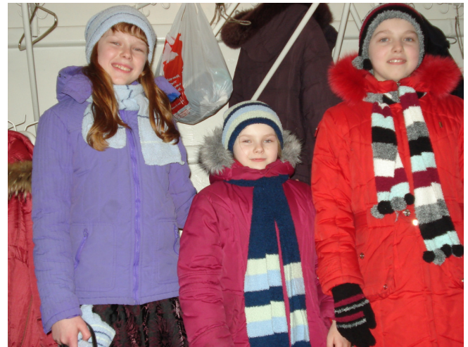
Hats and scarves given by an Alabama church