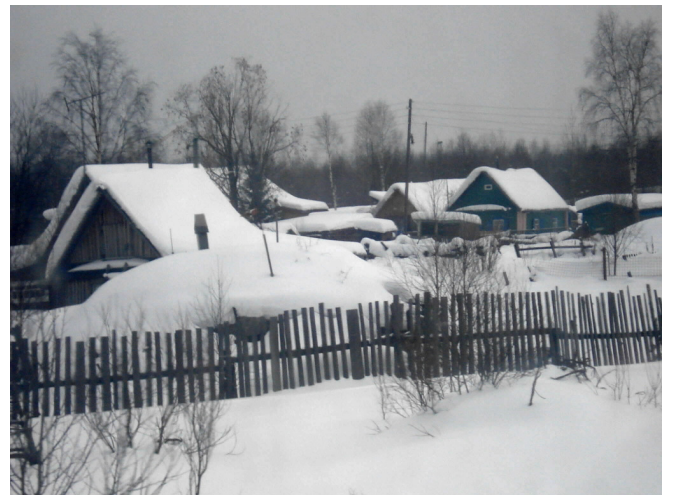
Typical snow scene---many times 5 feet deep