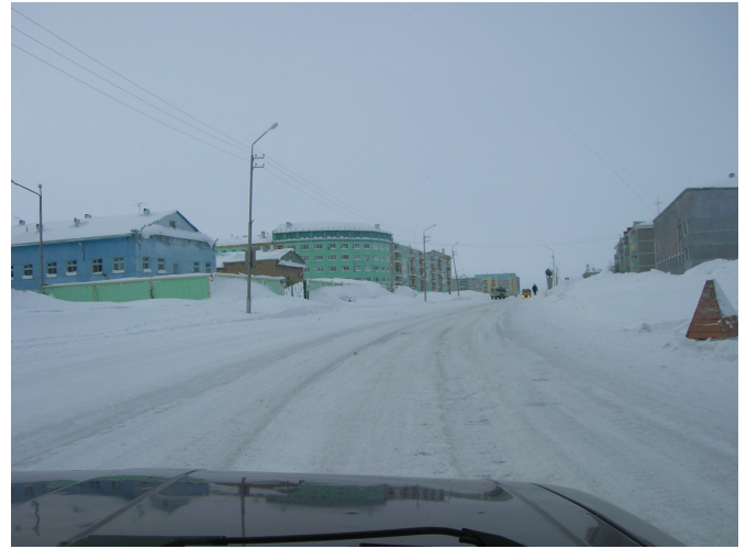
“A road less traveled”