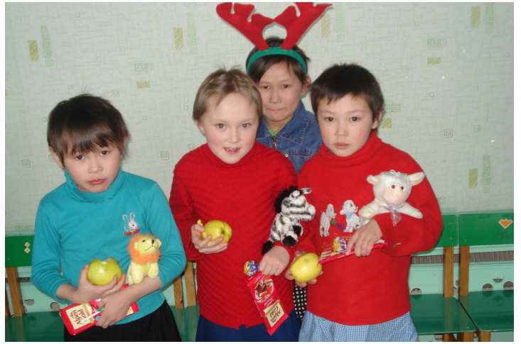
Some of the Nentsy children to whom we gave gifts