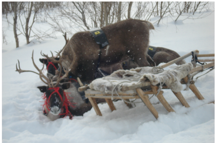
Dad parked the "car" at the boarding school so Mom could visit her little ones