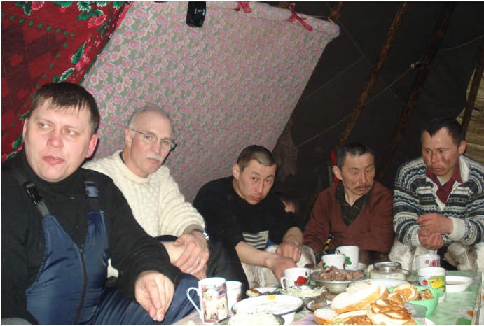
Breakfast in a teepee