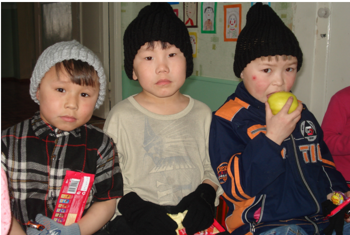
The boys will likely become reindeer herdsmen like their fathers