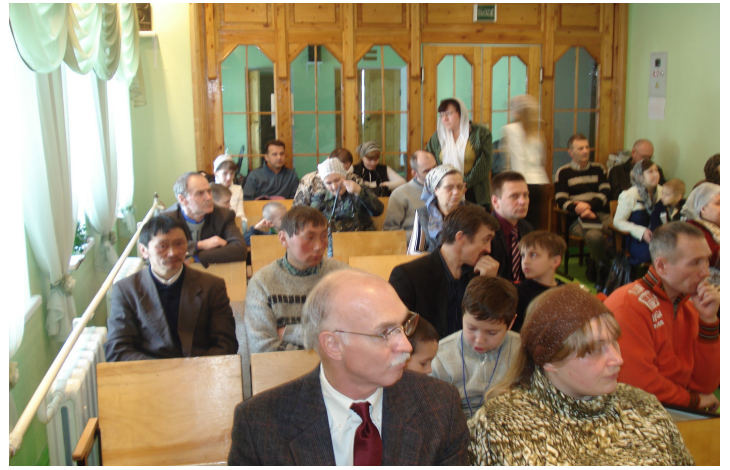
Russians, Ukrainians, Nentsy and Americans at church