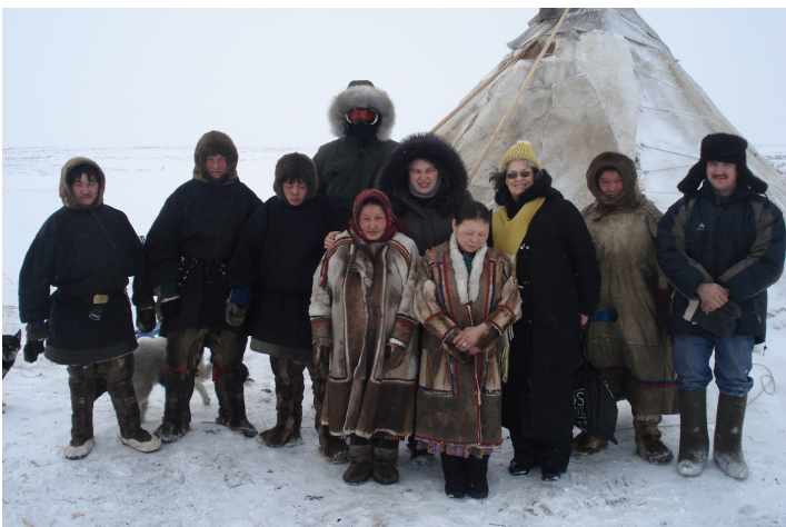
The team with the family of unsaved, pagan Nentsy to whom we ministered