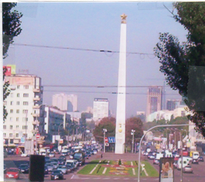
Victory square in downtown Kiev, capital of Ukraine.( not rush-hour)